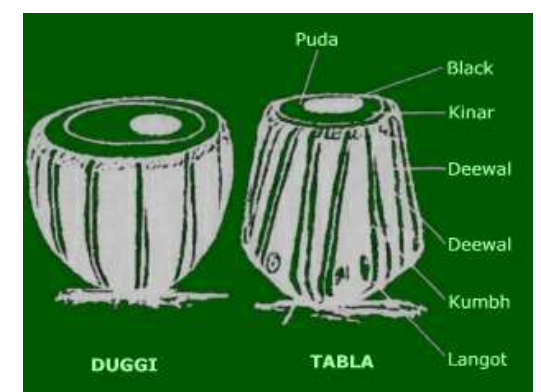
Plate 1. Indian drums: The duggi and the tabla

These, young houselord, are the 6 dangers from frequenting fairs [or shows].